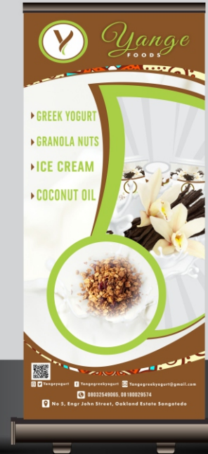
YANGE FOODS ROLL UP BANNER