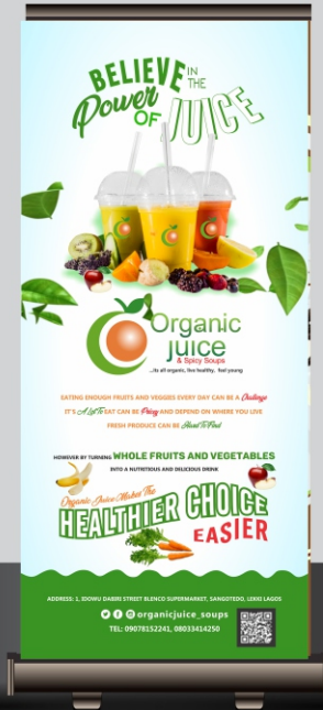
ORGANIC JUICE ROLL UP BANNER